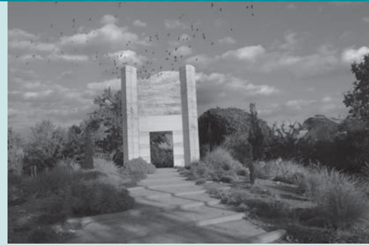
Walter Dunsberry, Damascus Gate , 2002