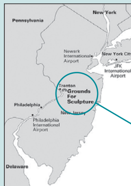
Grounds for Sculpture

By Train: From New York (Penn Station) take New Jersey Transit to the Hamilton stop (stop closest to Grounds for Sculpture) or Amtrak to Trenton stop. Taxi ride is 5 minutes to Grounds for Sculpture. Travel time is approximately the same as by car.